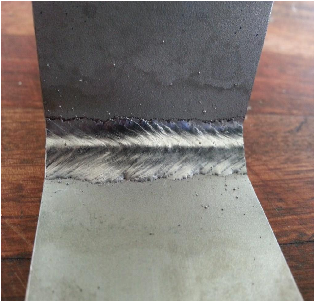
Figure 2: 2205 sample TIG Brush/TB-25 Cleaned - Copper Sulfate Test.

Note that the surface shows no copper deposits indicating no free iron present