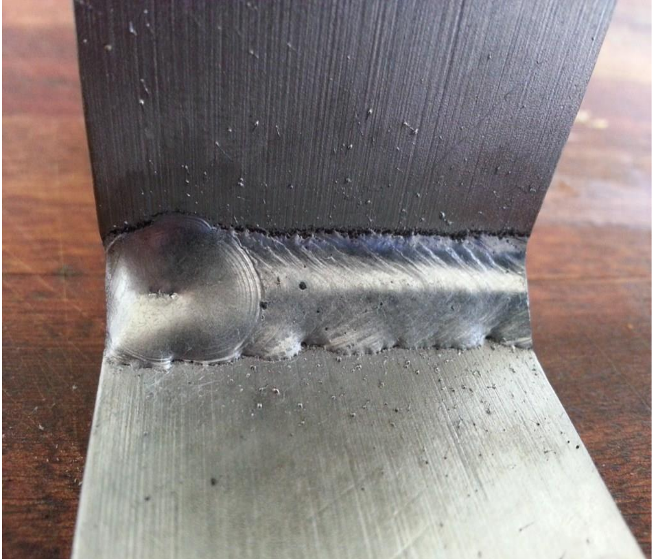
Figure 4: 2507 sample TIG Brush/TB-25 Cleaned - Copper Sulfate Test.

Note that the surface shows no copper deposits indicating no free iron present