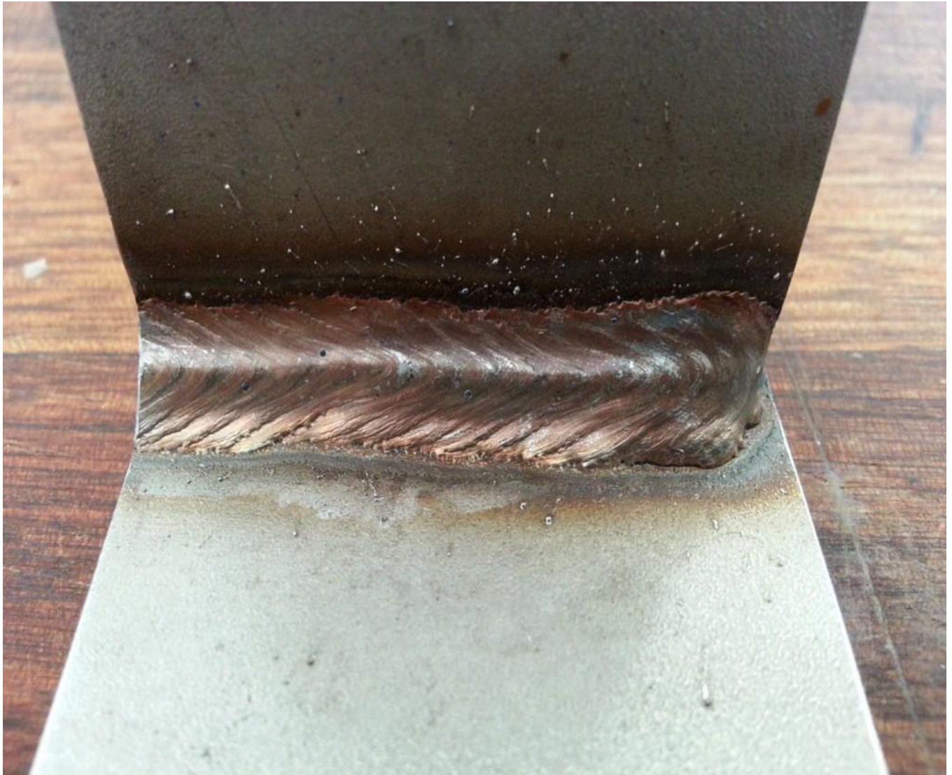
Figure 1: 2205 sample Untreated – Copper Sulfate Test

Note the copper deposits throughout the weld surface indicating the presence of free iron.